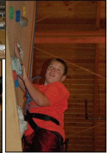
From top: Camp Abilities youth, whether grade school or high school, swam, bowled, danced and climbed their way to fitness in activities they can enjoy throughout their lives.