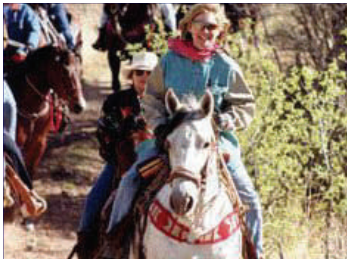
Ride the 17th annual Trail Ride free if you win the 2009 Trail Ride raffle. Contact the Foundation for your raffle tickets.

For more information about the Trial Ride, call the Foundation office, or log on to www.trailride.org .