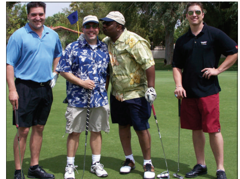
One of many happy foursomes at Swing for Success 2008.